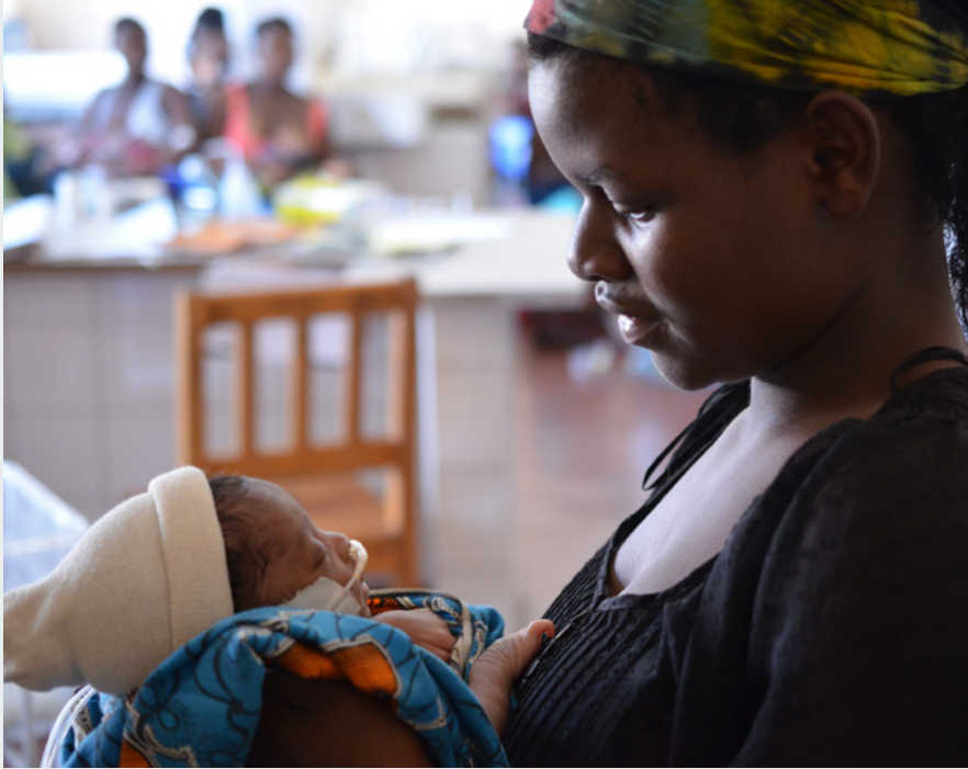
A mother and her safely-delivered newborn.

In March 2023, amidst a cholera outbreak of already historic proportions, Malawi was hit by Tropical Cyclone Freddy, a storm that shattered cyclone records and killed hundreds. The government declared a state of disaster, landslides destroyed villages, vital water and electricity sources were incapacitated for weeks, and cholera continued to spread.