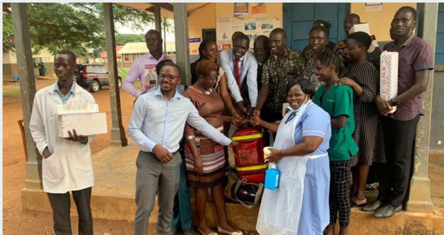
A newly trained ReACT team based at a small rural hospital receives an emergency medicine kit provided by Seed Global Health.

In the wake of the COVID-19 pandemic, the government of Uganda prioritized strengthening emergency care, a decision that was further reinforced after the 2022 Ebola outbreak. A new National Emergency Medical Services Policy and Strategy commits to educating 400 emergency medicine doctors over the next ten years.