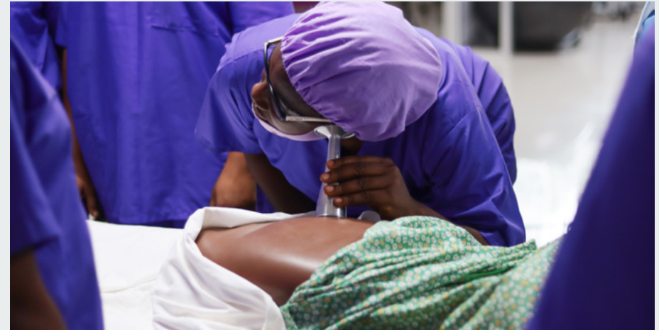
A midwifery student practices listening for a fetal heartbeat in a clinical skills lab.

Seed and our partners provide competency-based education for student midwives, ensuring they learn theory in the classroom and clinical practice in the hospitals. Key to this approach is training preceptors, who are practicing midwives trained