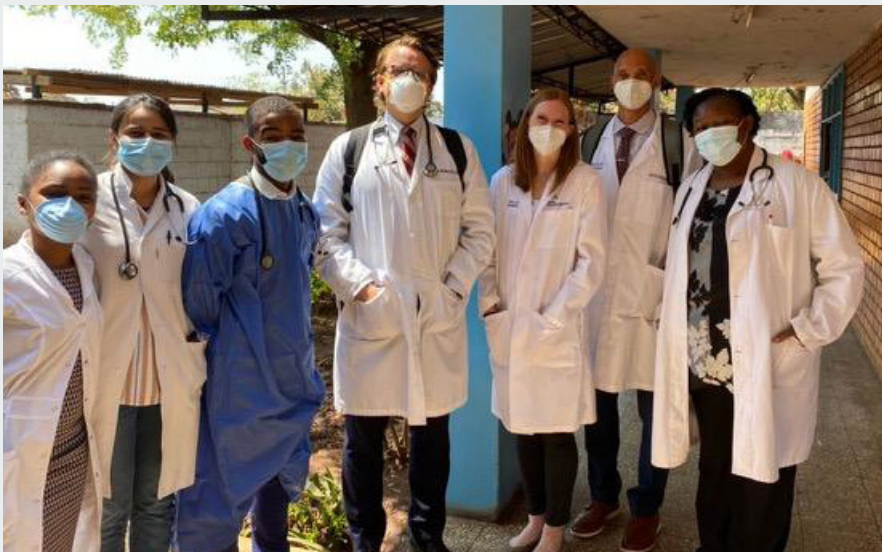
Seed Global Health staff and UNZA family medicine students at Chilenje hospital in Lusaka, Zambia.

Seed and our partners focus on family medicine because research shows that countries with strong primary health care systems centered on skilled family medicine doctors have better patient outcomes, increased patient satisfaction, and lower costs.