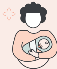
Maternal, Newborn, and Child Health